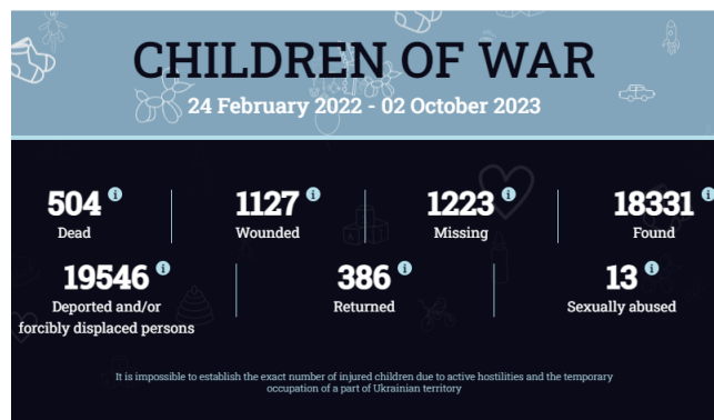
Figure 2. Number of children dead, wounded, disappeared, deported or forcibly displaced, or sexual abused violence as a result of actions committed by the Russian Federation

In the period from February 24, 2022 to October 2, 2023, according to the official information of the juvenile prosecutors, 504 children died and more than 1127 wounded ( https://childrenofwar.gov.ua ).