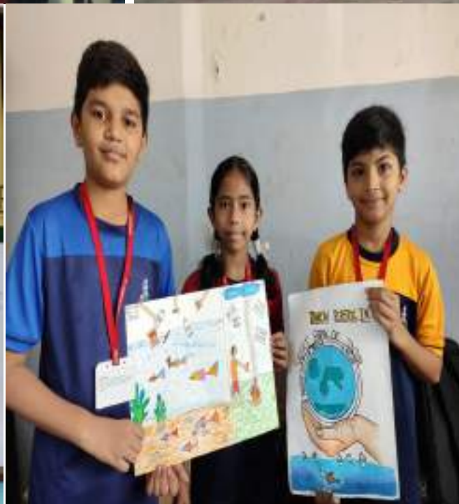
St. Sebastian School, Dabul, Mumbai