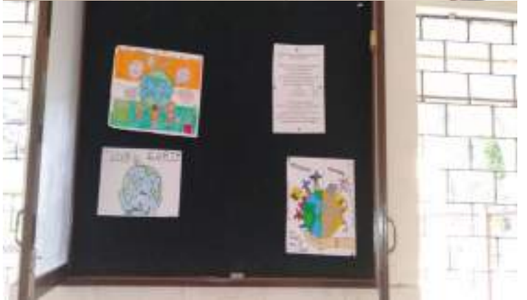
Victoria School, Mahim